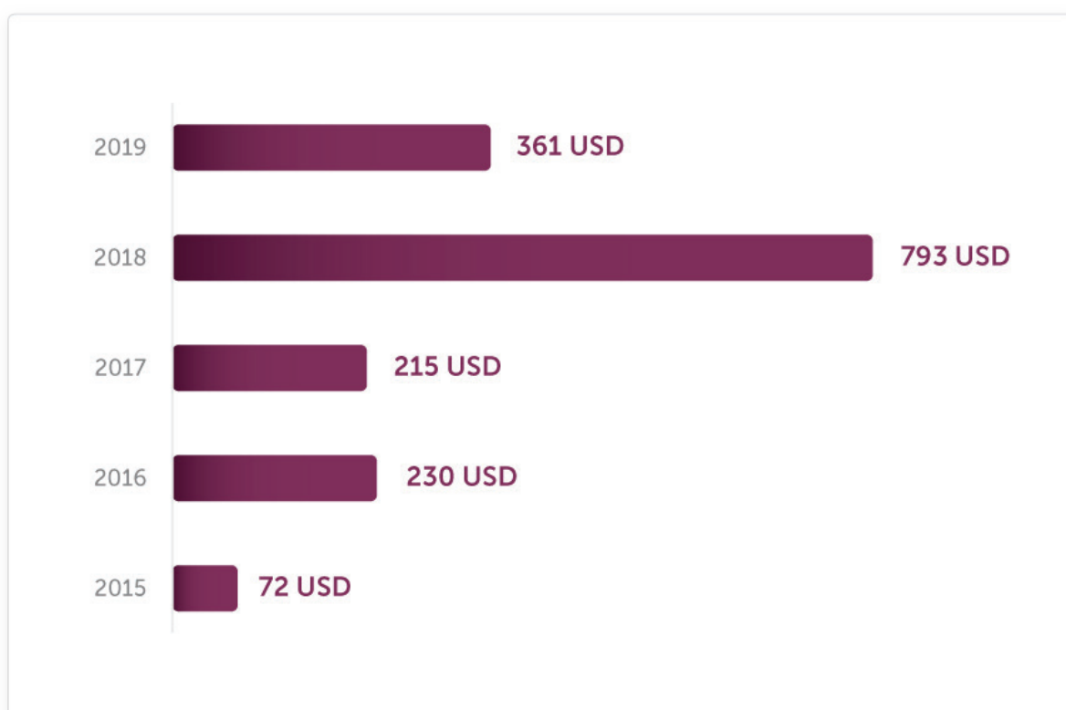
Graph 1 – Chinese FDIs in Serbia 2015-2019 (in USD million, including the investments from Hong Kong and Taiwan)